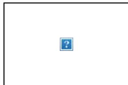
Iconic images from 2010