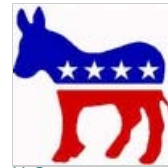
U.S. Democratic Party